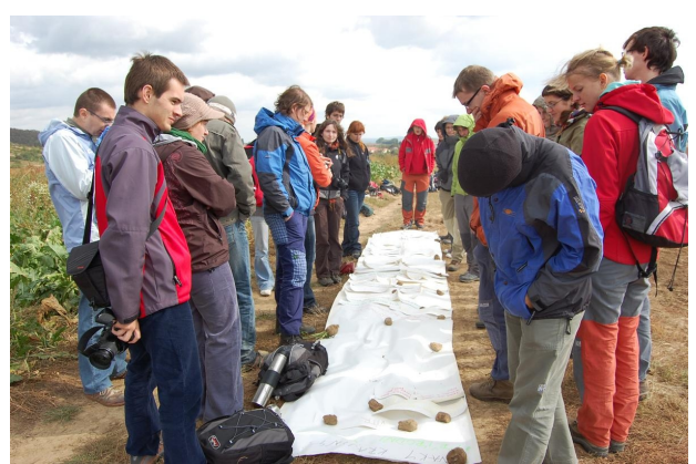
Picture 2: Landscape character assessment workshop

The differences between disciplines could be clearly seen during the landscape sketch as well (the technique of fast drawing to catch main landscape features). Landscape architects (artistic talent is the condition of entering the studies) have precise sketches, the understandability is but subject to artistic quality. Sketches are similar and impersonal, the personality is shown in the text. The page is fulfilled equally and step by step enhanced by details (consequence of education) with shown depth, as the quality of landscape the diversity is shown. The geographers (hand drawing is not developed during studies) do not have both the technique and speed. In the limited time they catch only (for them) important things, the genesis of sketches is more visible and so interpretation is easier - the dominant features usually mirrors study specialization (e.g. human geographers accent the human presence in landscape by drawing the highway, airplanes, other participants of the course or own legs). Both disciplines then emphasize vegetation (precise drawing) instead of buildings, equally catch positive (the church in Pozořice) and negative (high voltage line) manmade dominants.